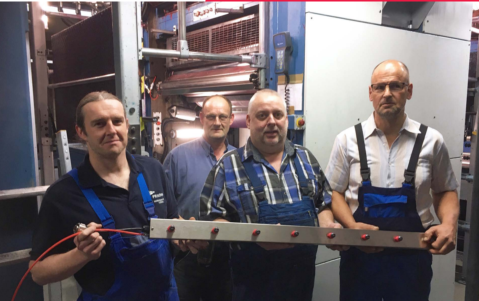
Production team at Boyens MediaPRINT GmbH, holding an EvenSpray World2 spraybar.