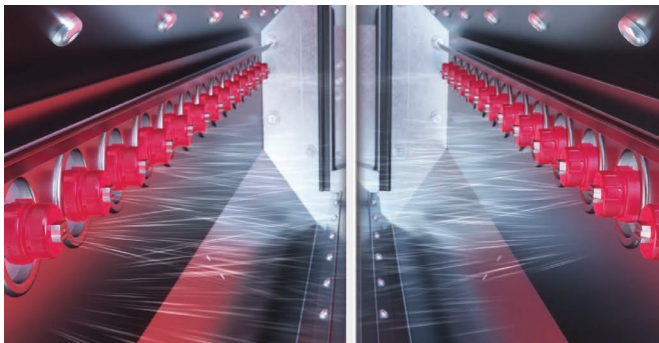
Precision Spray Single or dual side

Baldwin offers its unique and FOGRA approved cleaning solvent TowerWash 2. With high cleaning ability, the micro-emulsion efficiently removes lint and ink from blankets and guide rollers.