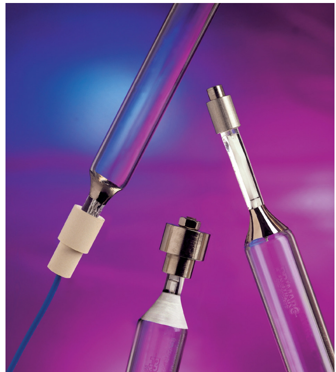
Publication nr. 2018_US

Baldwin has a large number of highly skilled Service engineers ready to support your installation for years to come, and always close at hand. You can rely on Baldwin Service expertise to maximize the lifetime of your equipment with outstanding results.