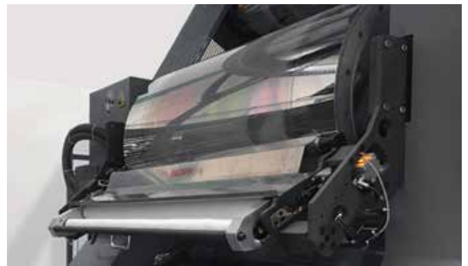
FilmCylinderCleaning installation in a film extrusion production line.

The cleaning system removes traces and deposits from the cylinder surface that may occur during the film extrusion process. A special long lasting lint-free microfilament cleaning cloth, the Baldwin FilmPac, absorbs the dirt and fluids from the cylinder surface without risk of scratching it – ensuring a continuous production with a consistent high film quality.