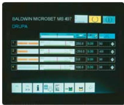
Touchpanel of the MicroSet 497: Input of individual glue patterns

With the contactless MicroSet systems, BALDWIN offers solutions which are both progressive and well-accepted for longitudinal gluing on web presses at high production speed. The inline gluing unit MicroSet 497 applies a continuous or intermittent glue line on the web in the running direction. Moreover, a folding aid for