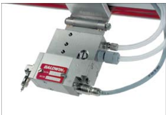
Applicator head of the MicroSet 497