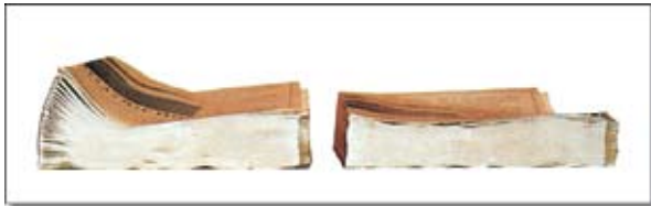
without folding aid