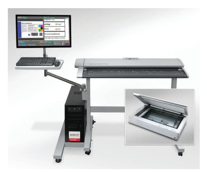
Guardian OLP verifies that the files used for production—or the beginning-ofrun press samples—match the customer-approved master file 100%.

We replace your hard drive, your Guardian OLP software, and your obsolete Windows® Operating System with the very latest—and help you easily migrate your valuable data—inexpensively, and without entering your facility.