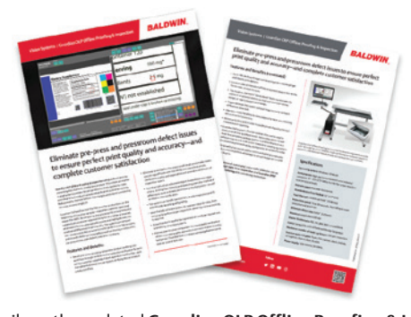
For full details on the updated Guardian OLP Offline Proofing & Inspection , download the brochure >